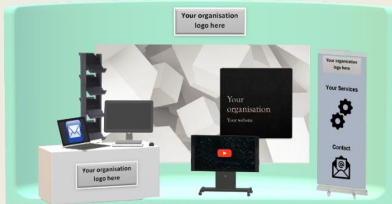
Generic virtual booth

If you are interested in exhibiting at the UltraWire EXPO or you would like to get more information about how to get your virtual exhibition, please send an email to: info@ultrawire.eu or info@cnt-ltd.co.uk info@cnt-innovation.com